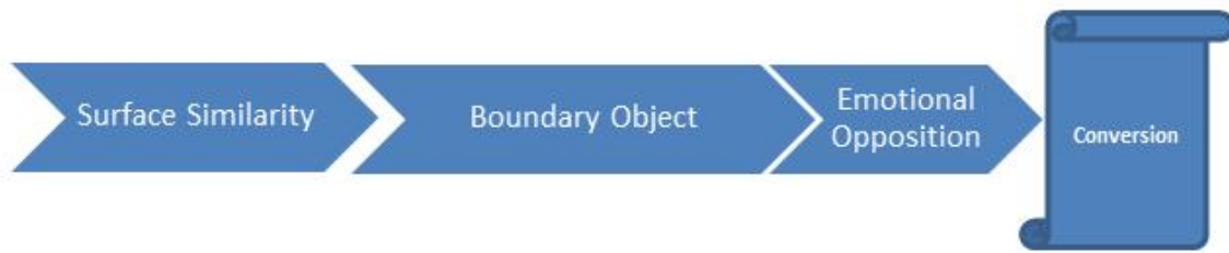
Figure 2: The Progression of “Acceptance” in the Mori Uncanny Valley

Given the existence of two labels (categories) to describe some item/event/context and the emotional attachment of the observer to the first label, as the perceived characteristics which fall into label #2 increase the observer shifts his/her perception of that label from 1) surface similarities which only highlight differences to 2) boundary objects which give rise to explorations of metaphor to 3) emotional opposition which blocks “rational discussion” to finally a begrudging acceptance that perhaps label #2 is a “better” fit.